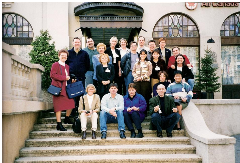
EfCCNa Representatives Meeting, Zagreb/Croatia, Spring 1999