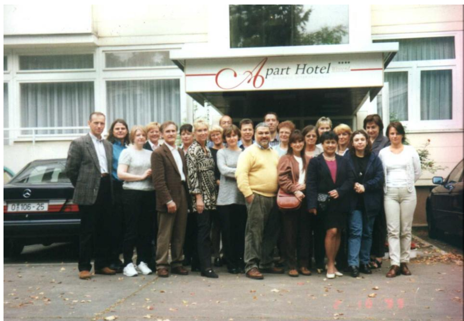
EfCCNa Founding Meeting, Berlin/Germany, 02.10.1999